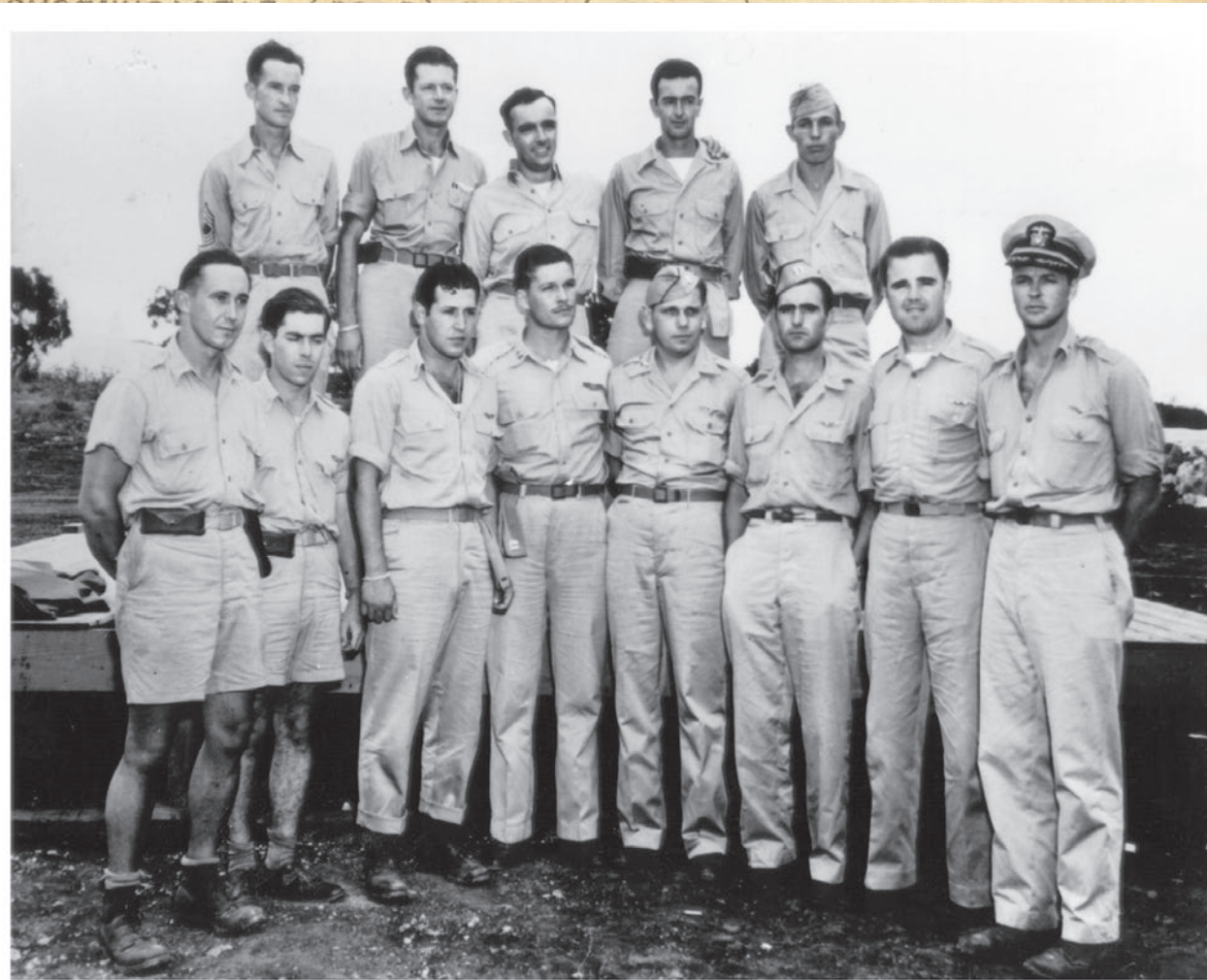
The Army and Navy crew who delivered the Last Bomb to Nagasaki